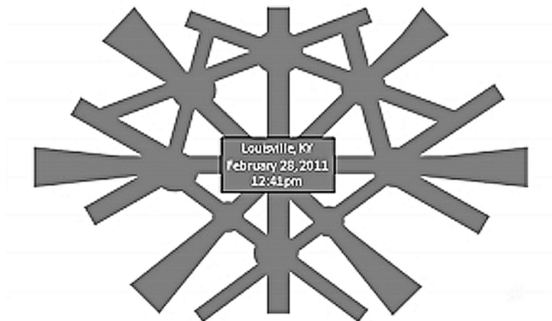
Figure 2: Traffic Model of Linguistic Heterogeneity

I mentioned above that it is difficult to represent graphically the relations between different language and literacy practices that their pluralization seems to demand, as opposed to an archipelago model. The archipelago model achieves simplicity at the cost of failing to represent, or acknowledge, the traffic among peoples and practices that obtains in, well, practice, on the ground, and the agency of language users in helping to shape and reshape those language practices. What is needed, in other words, is a model that brings in, among other factors, the temporal dimension, and that dispenses with the affordances of Venn diagrams. Figure 2 is one possible alternative representation of relations among language and literacy practitioners, modeled after images of traffic patterns.