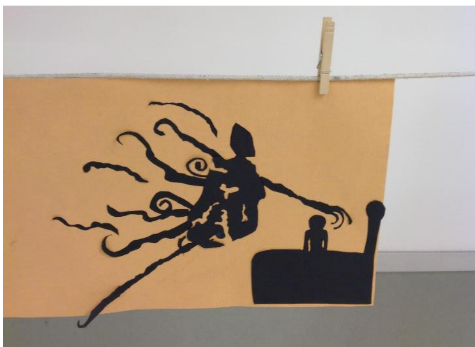
Figure 3. Brittany's visual art response to the word "scared."

Brittany chose the word Scared and took care to create the image in Figure 3 to express it. In it, a shape that is at once beautiful and disturbing overwhelms the space of the page. It appears to be a creature with tendrils that flow behind and around it, even extending beyond the frame of the paper. Much smaller, a body sits upright in a bed in the right bottom corner. The creature's spooky long arm, with several bony long fingers, reaches toward the child-like body.