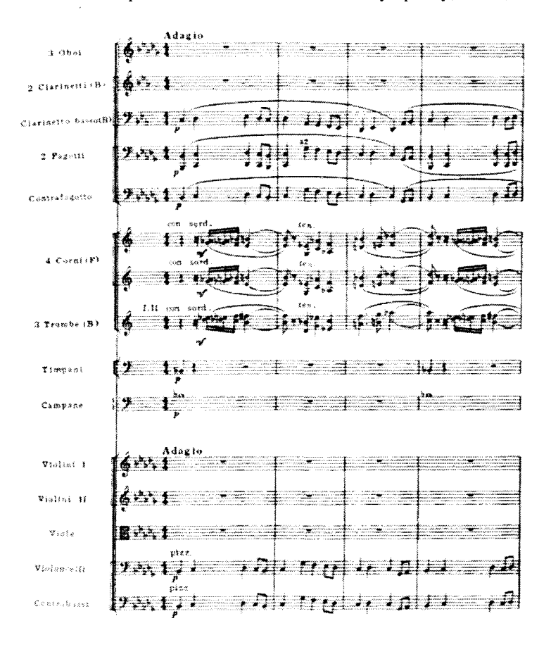
Musical Example 1- Shostakovich, Thirteenth Symphony, mvt. I, ms. 1 to ms. 4

One motive that is used throughout the work is the modal cadence introduced in the first bars of the symphony, illustrated in the 'cellos and basses in the pickup to bar four of musical example 1. This cadence serves the local harmonic function of establishing a reference to a central pitch, and also serves to unify the symphony. The cadence is used in movements one, three, four, and five. The introduction of the third movement incorporates the modal cadence into the main thematic material of the movement (see musical example 9), material that is also used in the fourth movement (see musical example 10). The technical function of these gestures creates musical unification throughout the symphony.