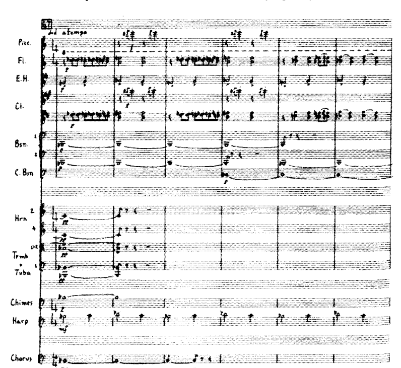
Musical Example 6- Shostakovich, Thirteenth Symphony, mvt. II, reh. 47 to reh. 47+6

musical example 6. The tonality, modal cadence, tolling bell, slow ostinato accompaniment, and expanding clarinet line which imitates the horn gesture at the beginning of the first movement contribute to the creation of this reminiscence.