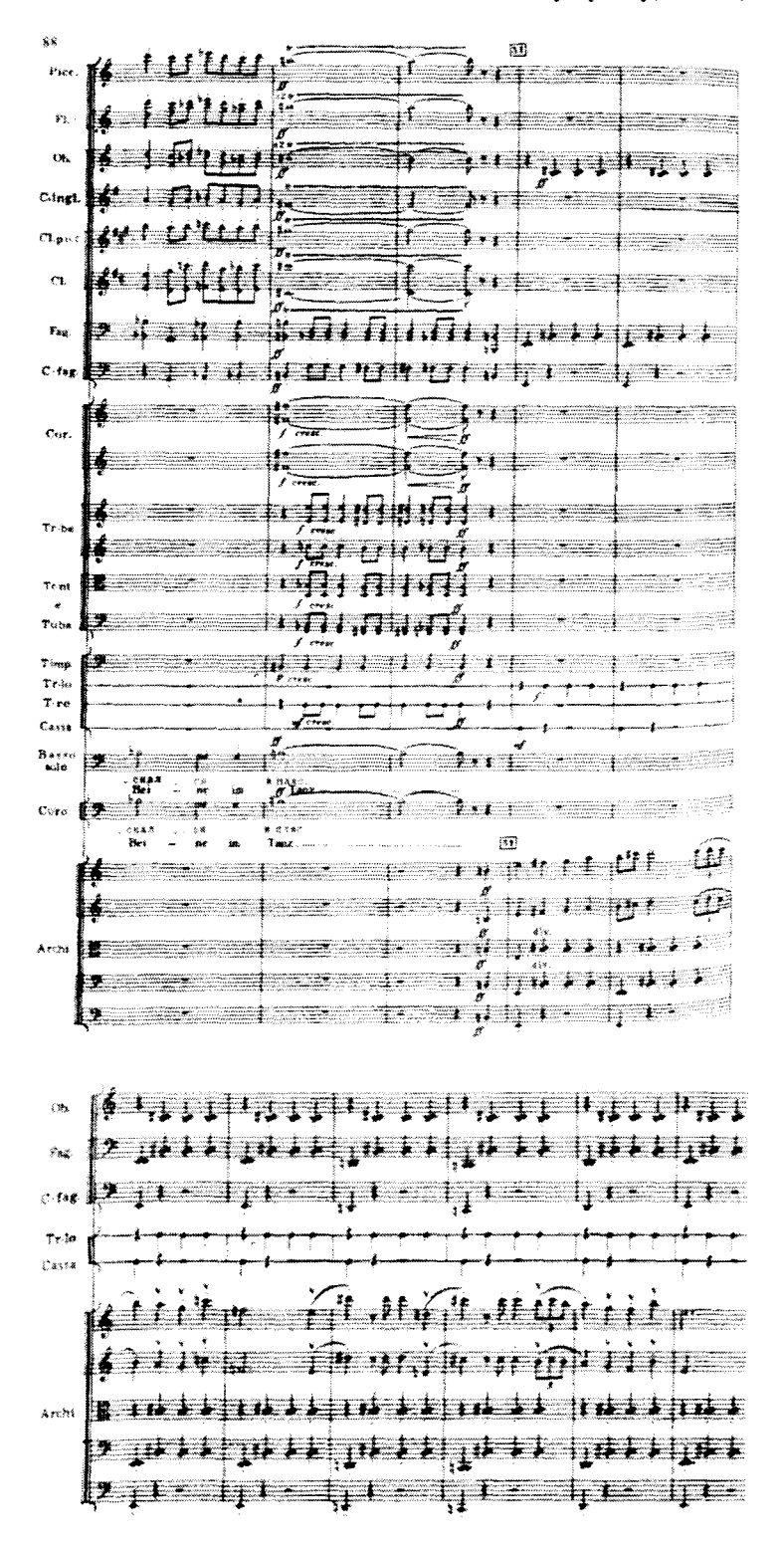
Musical Example 8- Shostakovich, Thirteenth Symphony, mvt. II, 3-reh. 51 to reh. 57+2

The quotation from the second movement is provided for comparison in musical example 8.