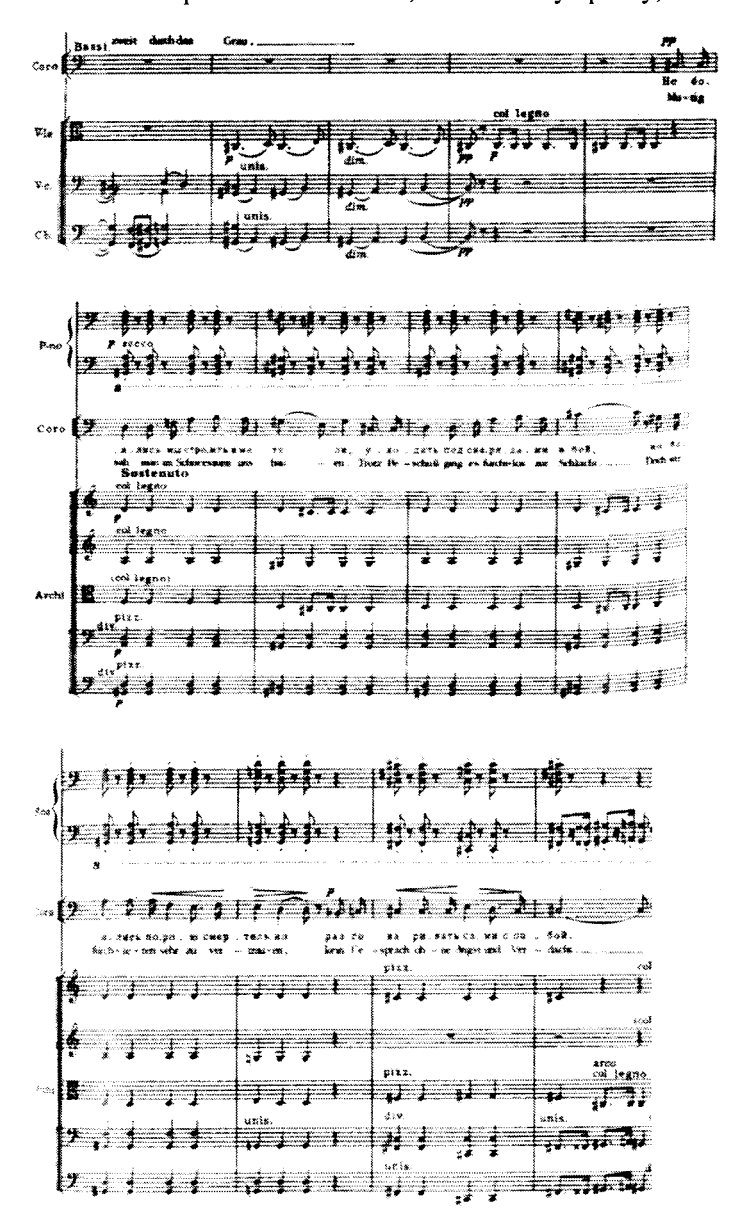
Musical Example 14- Shostakovich, Thirteenth Symphony, mvt. IV, reh. 3- reh. 110 to reh. 110+8

In the symphony, the hollow bombast of propaganda music is portrayed through the power of the massed choir and the martial rhythm. By locating the paraphrase of an established musical style within the critique of the text, Shostakovich uses the materials of the regime to criticize the regime itself, while drawing parallels between criticisms from movements one and four.