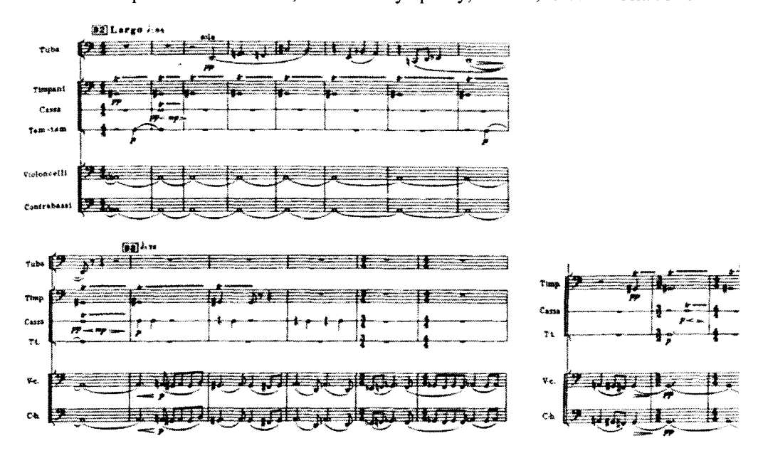
Musical Example 10- Shostakovich, Thirteenth Symphony, mvt. IV, reh. 92 to reh. 93+8

Shostakovich uses a similar procedure to transition to the next movement. At reh. 118 (see musical example 11), he starts to establish F major in order to prepare the modulation to B<sup>b</sup> major in the next movement.