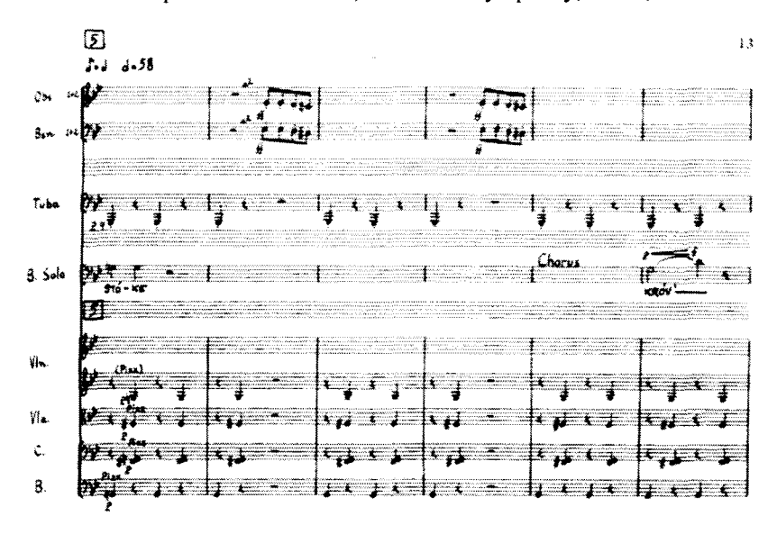
Musical Example 4- Shostakovich, Thirteenth Symphony, mvt. I, reh. 5 to reh. 5+6

This section is similar to another work by Shostakovich, "Happiness," song 11 from the cycle "From Jewish Folk Poetry" (see musical example 5). There are two main similarities. The first is the short motive spanning a minor third that concludes the phrase (see example 4, reh. 5+1 and example 5, ms. 14). The second is the similarity in the accompaniments, with a minor second dyad on an upbeat, an accompaniment Joachim Braun calls a "klezmer 'um-pa'... over a pedal harmony."