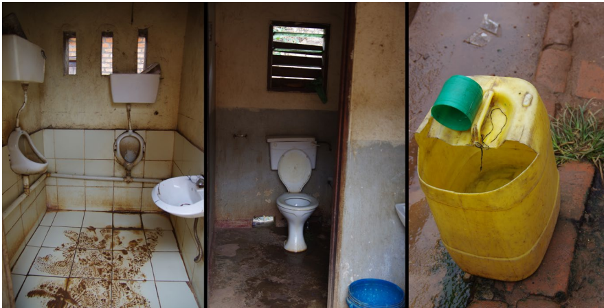
FIGURE 3 Urinal, flush toilet, and handwashing station infrastructure near Mzuzu Central Market fish vendors

a consistent temperature. No vendors actually monitored the temperature; no thermometers were present or used by vendors. When using ice, vendors reported getting it from a shop within the market area; they did not make their own ice. For the mobile vendors, fish were not covered with block ice, a sunlight barrier, or a dust barrier.