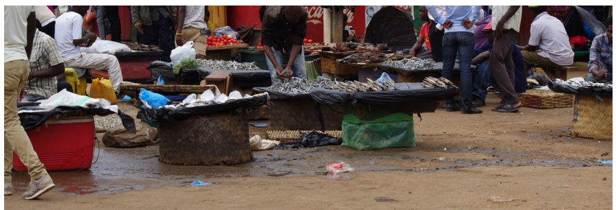
FIGURE 1 Fresh fish being sold at an open-air market, Mzuzu, Malawi

When a water source was available at the market, a 100 ml water sample was collected ( n = 3 ; Mzuzu Central Market, Chibavi Market, and Zolozolo Market). Two fresh fish were purchased, and a 100 ml sample of water used for washing the fresh fish was also collected from the 25 vendors. Water samples were collected in Whirl-Pak®