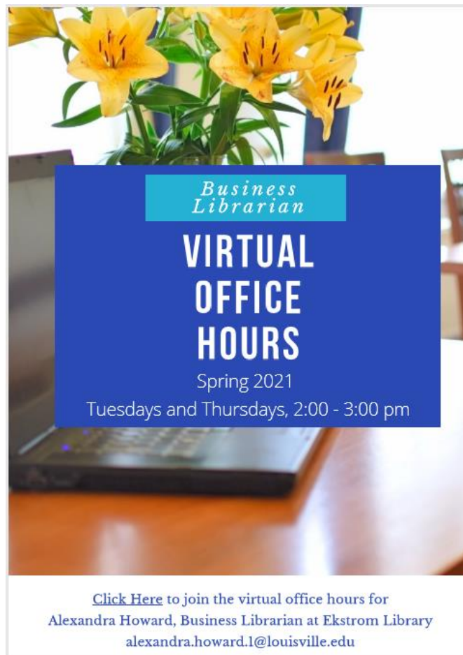
Figure 2 VIRTUAL OFFICE HOURS FLYER.

The author emailed the flyer to her faculty contacts in the College of Business. She also used her newly discovered virtual outreach tool, the College of Business's weekly newsletter, to advertise the Virtual Office Hours. The author worked with the University Libraries' Head of Web Technology to incorporate a link to the Virtual Office Hours in the Business Librarian's library profile. After sharing the idea of holding Virtual Office Hours in a RAI department meeting, the other librarians in the department decided they would also hold Virtual Office Hours in the spring semester. This helped increase the visibility and accessibility of the Virtual Office Hours. One of the concerns about the Virtual Office Hours was what would happen if someone needed to cancel their hours. To address this, a Virtual