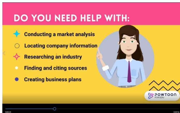
Figure 3 SCREENSHOT OF PITCH SWITCH VIDEO FOR STUDENTS.

While the author made the pitch video for students, there were several edits that needed to be made before the video could be published and shared. The pitch video was made with a music track and no narration. This presents issues for accessibility and ADA-compliance. The video is also longer than one minute which is not a best practice for pitches. In her first year, the author decided to focus on other virtual outreach methods. She plans to update the student pitch video and disseminate it at the beginning of the Fall 2021 semester. Her plan is to send the pitch video to student orientation organizers, academic advisors, and faculty in the College of Business. She also hopes the video will be shared on both the library and the College of Business's social media pages.