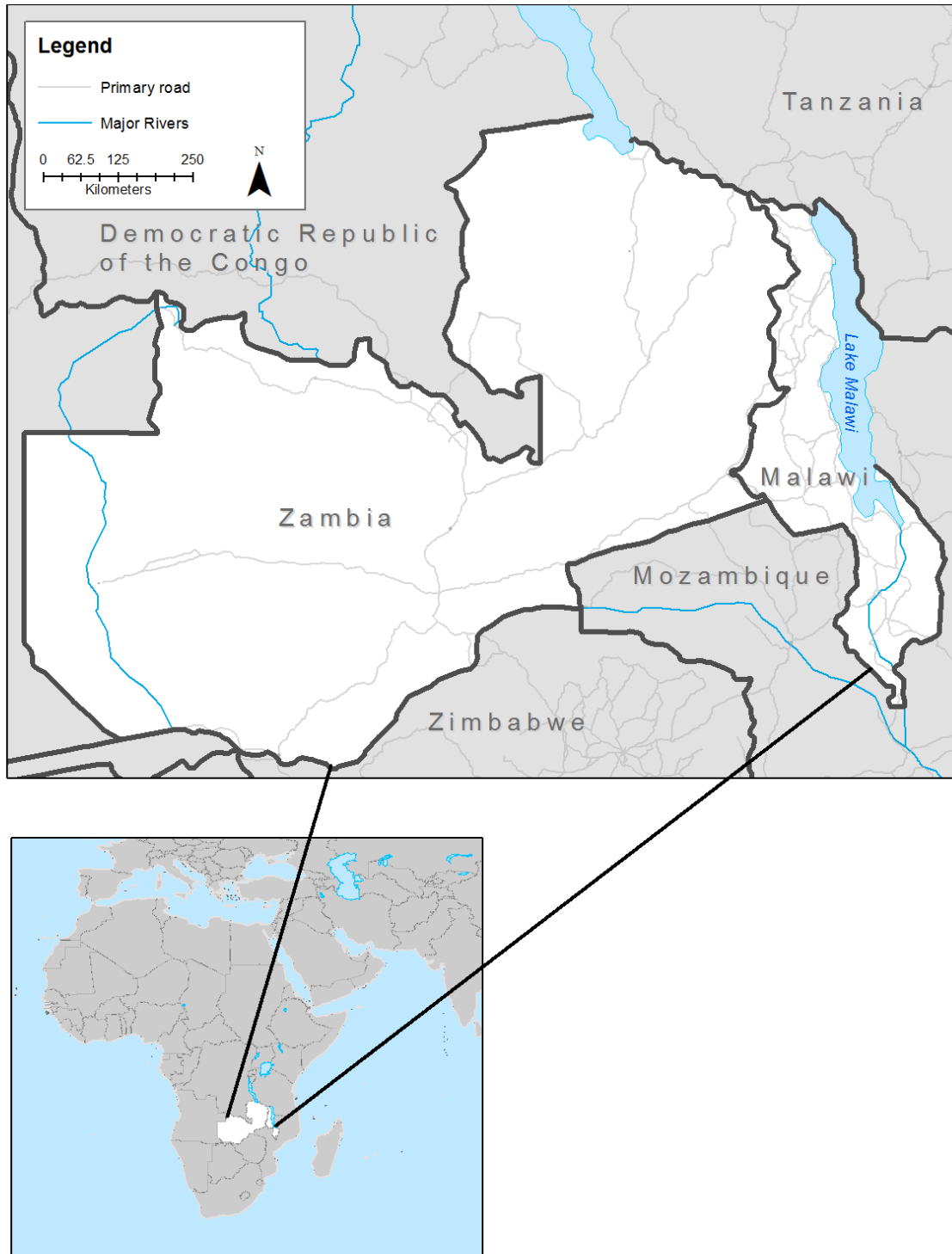
Figure 1. Study Area, Malawi and Zambia, Africa.

for regulating water and sanitation services offered by commercial utilities. Management of faecal sludge from pit latrines in the context of desludging, transportation and utilization is a new sector in Zambia.