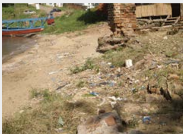
Figure 2: Nkhata Bay, Malawi

Improvement of rural sanitation issues through the private sector is supported at the national level. Private sector participation in the delivery of sanitation and hygiene services in Malawi is directed by the National Water Policy (Malawi Government, 2005), National Sanitation Policy (Malawi Government, 2008), Microfinance Policy and Action Plan (Malawi Government, 2002), and the Public Private Partnership Framework (Malawi Government, 2011b), with the latter including sanitation as a specific business growth area.