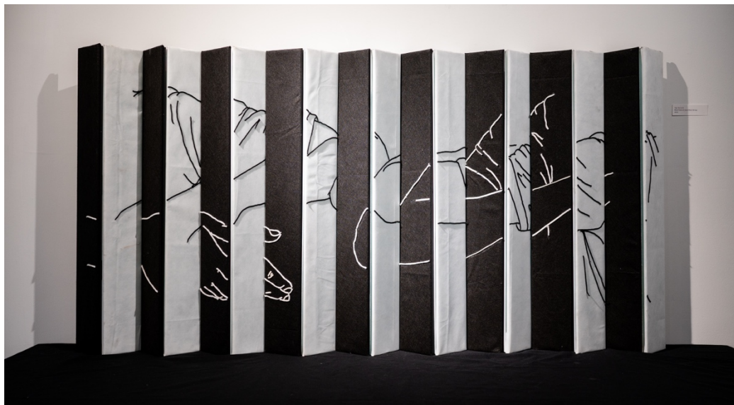
Figure 13a: EVPL. Tag! You're It! . COVID-19 Mask Fabric and Used Mask Strings. 2022.

Another phenomenon that emerged was that of the elbow bump; this gestural salutation came at a time in which people were not as afraid to interact under masked circumstances, yet did not want to risk surface-based transmission or contamination. However, at this current time, we seem to be in a transitional phase during which guidelines are easing, yet we are collectively holding our breath waiting for another wave of case from a new strain or the possibility of hope. That is to say that many people are unsure, or in the least, not quite in agreement of how to navigate shared spaces and contact, such as handshakes and elbow bumps, as addressed in my lenticular artwork Tag! You're It! (2022).