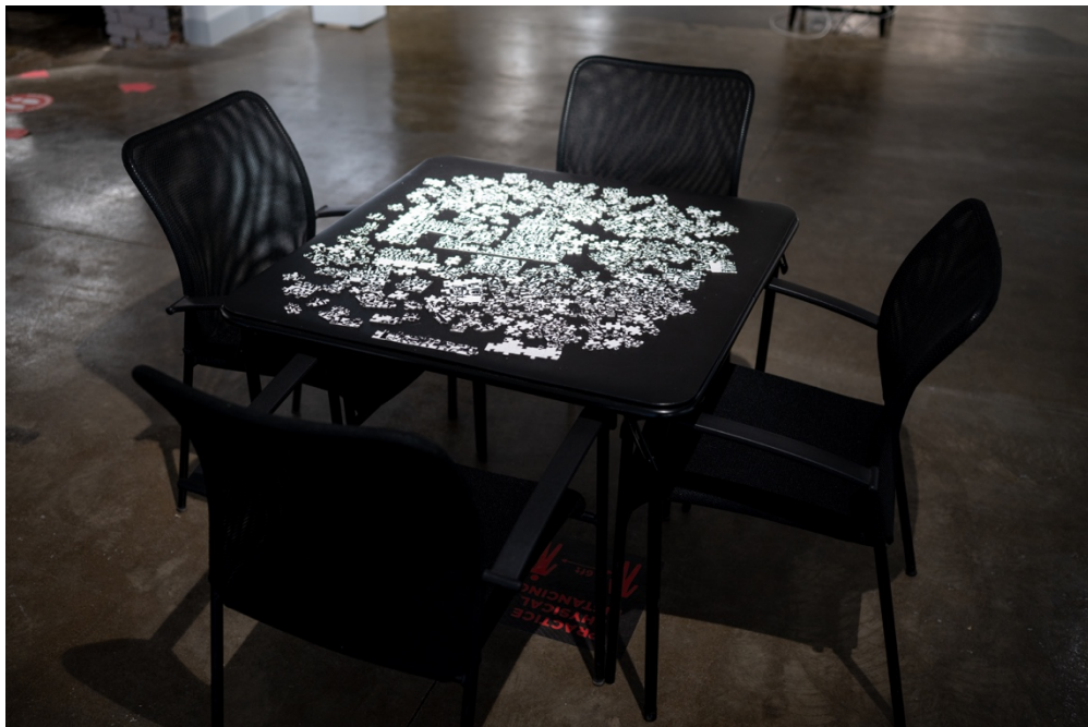
Figure 6a: EVPL. Fluxx. Jigsaw Puzzle on a Card Table. 2022.

adapt to the shifting social etiquette of shared space. During my opening reception on April 15 th , 2022 in which this piece premiered, people were more hesitant to sit down with strangers to play a game, so most of the engagement with the interactive works exemplified this decision-making process of trusting someone to share a close proximity. As a result, most of the people who sat together to interact with the puzzle were people who came into the exhibition together, thus, showing that the current social engagement with objects and space are still distinct from in the height of the pandemic—when people would not have come in the first place—and before the pandemic—when people would have been more inclined to share closer proximities.