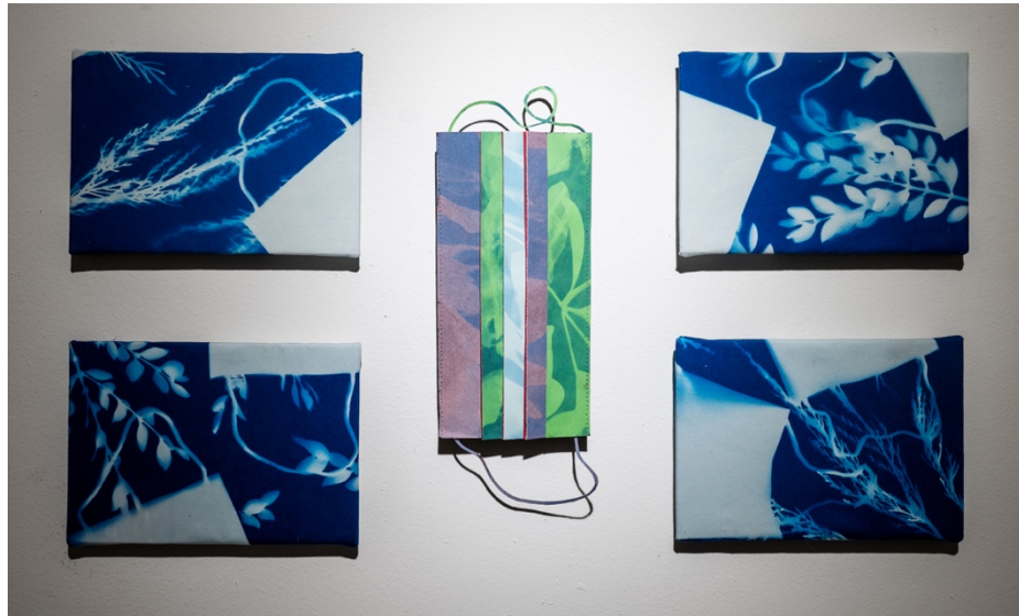
Figure 12: EVPL. 2020 Botanical Prints . Cyanotype Prints & Collage. 2022.

synonymous with the pandemic, such that as time passed, my series title 2020 Botanical Prints did not lose any of its meaning, but rather served to reiterate the cultural memory and attachment to the particular visual language of “2020.”