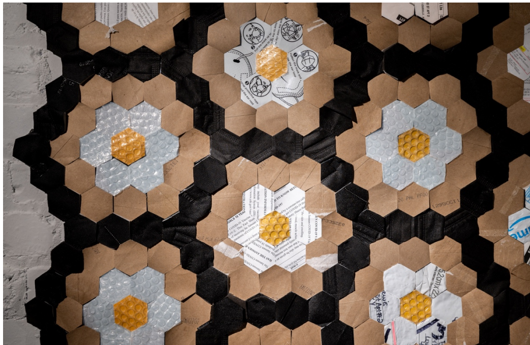
Figure 3b: Detail.

As altered found objects, the quilt components diverge from their original forms to construct a new recognizable form in their composite assemblage. Using found objects from my personal time in the pandemic, as the paperwork was all related to me and the masks worn on my face, fosters a visceral response in viewers that a mere copy could not construct in the work. As a result, my physical relationship to the objects does in a way mimic that of a quilt, existing within my home and touching my skin. The object’s history—it’s memory—enriches the concept of the artwork from its mass production in response to the pandemic to its intimate use on people’s faces, consequentially affecting the means in which audiences may navigate the space surrounding it. While many of my works are interactive and tactile, the quilt is not, and viewers would be reluctant to touch it even if invited to do so because of my experience interacting with the object, particularly the masks, by breathing into each one for days. This perception affects the way viewers participate in its space, reflecting the pandemic’s social spatial shift.