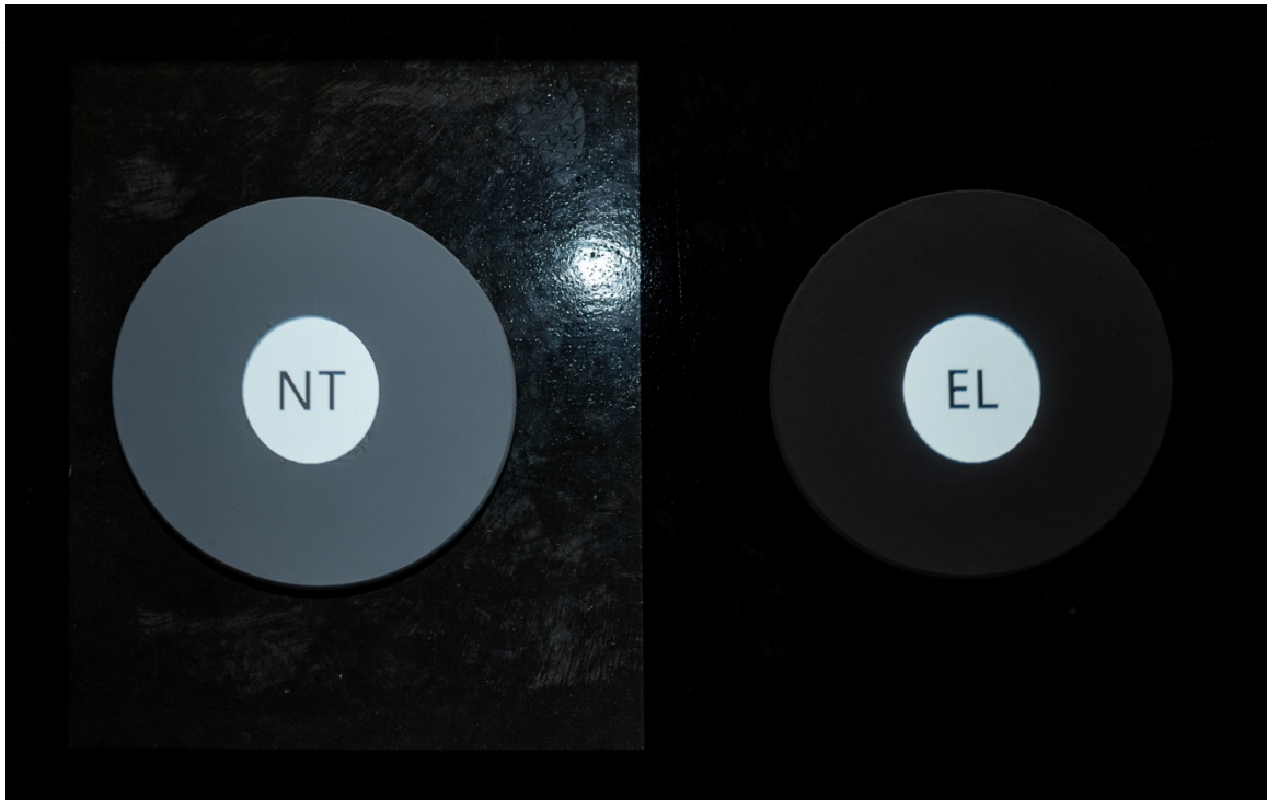
Figure 1: EVPL. A Paradox of Eye Contact . Video Projection. 2022.

however, the audience can only see their initials, “EL” and “NT,” and the light behind them rhythmically illuminating as they take turns speaking to each other. The experience is purely visual, though, ironically, both users have their cameras off. As a result, the audience is forced to confront the total lack of humanity in an exchange that we have come to rhetorically code as two people talking online, assuming there are faces behind the screens, despite the fact that the visual information totally lacks names, faces, and voices. By using the projector as a medium, the piece echoes the actual mode of communication, thus, making it more recognizable and relatable to audience members who have seen similar interactions themselves as filtered through a screen aesthetic.