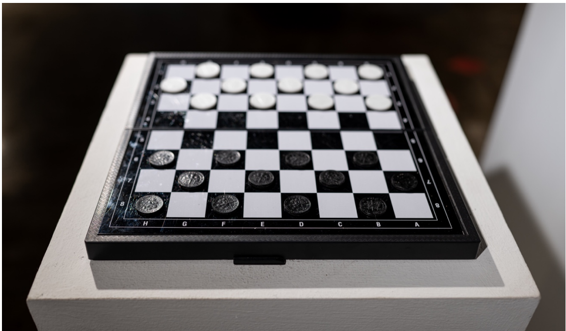
Figure 15: EVPL. Who Makes the Rules? Who Plays the Game?. Resin & Found Object (Chess/Checkerboard with Cast Nickels and Dimes). 2022.

Though much of my work addresses systems, most of which themselves seem to be connected to money, the most blatant example is the participatory work Who Makes the Rules? Who Plays the Game? (2022), which consists of a found object chess/checkerboard with cast nickels and dimes as the game pieces. Building off the idiom “nickel and dime,” this work examines the impact of socioeconomic status on social systems. Oftentimes, those who make the rules are not the ones who have to play by them. Further, when certain laws are met with financial consequences, it becomes a matter of who can and cannot afford to break the law in the same manner that I previously addressed who could afford to avoid exposure during the pandemic.