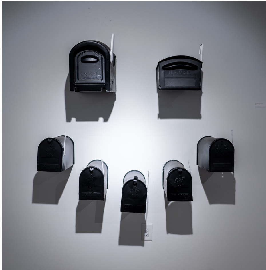
Figure 16a: EVPL. Blue Peaches Taste the Sweetest . Altered Found Object (Mailboxes). 2022.

The work is constructed of seven mailboxes, eerily assembled into a smiley face, and as viewers interact with the objects by opening the mailboxes, they will see that the bottoms have been removed. By installing the work a bit lower than the gallery-standard 58- to 60-inch midpoint, the majority of viewers will not be able to see the missing bottoms of the mailboxes, thus, assuming their functionality based on previous interactions with mailboxes. However, like systems, upon actual use, the mailboxes are exposed to be faulty and futile as the audience members navigate the space and choose whether or not to touch the objects.