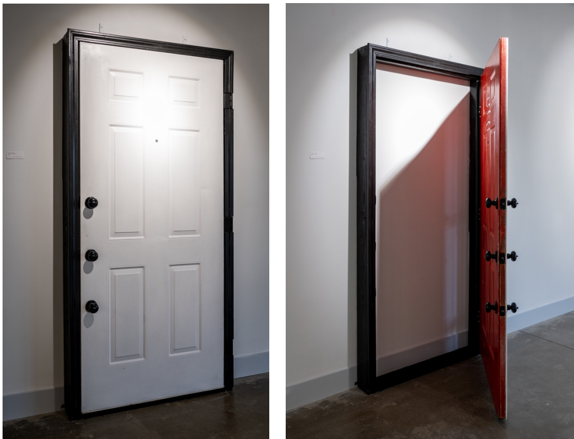
Figure 7: EVPL. The American Dream . Altered Found Object (Door). 2021.

with the reality that the door was simply not made for one person alone, viewers must decide whether to accept futility in their isolated efforts and exclusion from accessing the artwork, to continue struggling for access, or to engage with the people around them to ask for help. Due to the proximity of the doorknobs, collaborators cannot maintain the 6-foot or 3-foot social distancing recommendation, presenting another facet of the choice to engage with the object and those in the gallery. No matter their decision, they are participating in the artwork by deciding how to navigate the space at all. The American Dream primarily functions to facilitate an experience of unmet expectations and exclusion, while rhetorically manipulating the way that users interact with the space surrounding it, again, choosing whether to interact, to what capacity, and with whom.