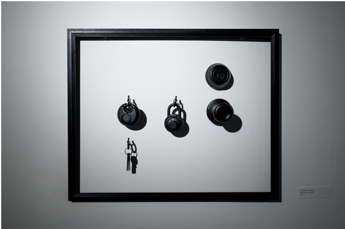
Figure 14: EVPL. A Parable of Privilege . Found Object (Key Lock, Combination Lock, Deadbolt, Doorknob). 2022.

Each lock represents different levels of exclusion respectively: lacking the appropriate resources, lacking the information of how to access, and lacking an invitation to open the door at all. All of these locks imply that others were able to get in because they either had different locks, different means of opening these same locks, or even no locks at all, depending on how society has structured itself to react to their intersectional identities.