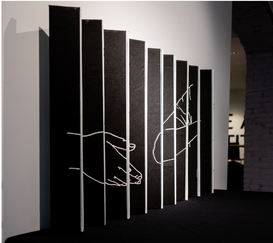
Figure 13b: Detail.

Following my monochromatic color scheme, the artwork is composed of PPE mask fabric and used mask strings that form line drawings, with one side depicting an elbow bump and the other showing one outstretched hand and one extended elbow, the latter of which is the inverted color scheme of the former. The piece communicates the visceral feeling of touch, literally depicting this transitional phase in social etiquette of shared space and contact, while also being constructed of mask strings that were worn by my parents in the medical field a year ago. While any germs on the mask strings are gone at this point, it is impactful to know that the found objects themselves were actively present in COVID units, thus, changing the way we inhabit the gallery space around them.