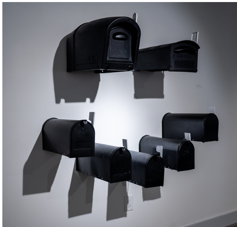
Figure 16b: Side View.

Many times, people in privileged positions assume that systems work because that is what they have been taught, but for many groups of people, the systems have been built against them, as with the examples of voter suppression addressed above. To reflect on this example, I used mailboxes to directly point to the 2020 attempt to discredit mail-in ballots. I arranged them into a smiley face to reference the appearance of equity and also to loosely address the chilling concept of America being “great again” when it has never been great for all of its people.