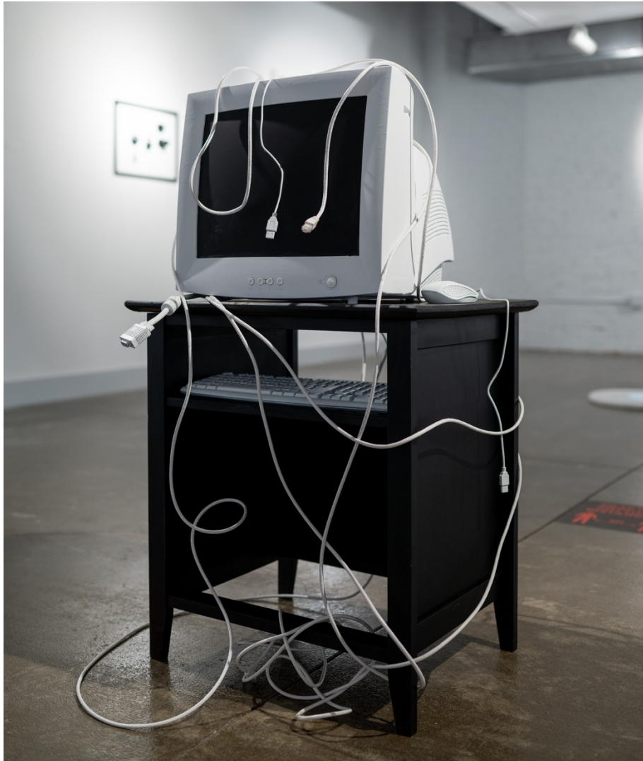
Figure 11: EVPL. Ode to the Synthetic Tether. Altered Found Object (Desktop Computer). 2022.

To further ruminate on the “different boats” or circumstances through which we weather the storm, one must acknowledge that alongside privileges and resources, there is the subjective experience of living a life from one’s own perspective and experiences.