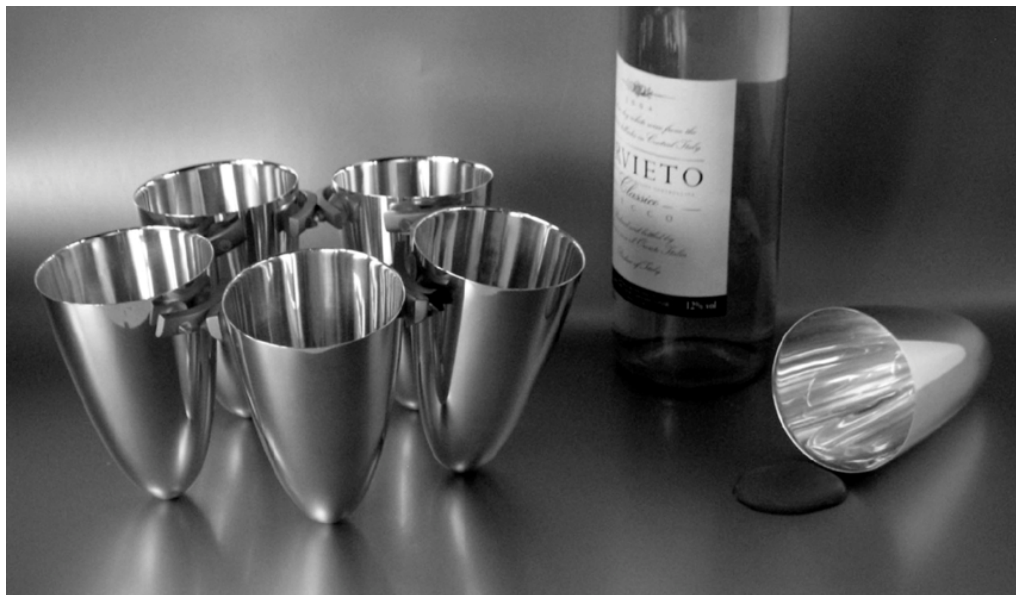
Figure 8: Kristina Niedderer. Social Cups . Performative Object. 1999.

Professor of Design Kristina Niedderer utilizes a similar format of relational aesthetics within what she calls “Performative Objects.” For instance, her Social Cups (1999) resemble wine glasses without stems or feet, such that they could not stand upright on their own, yet when three or more of them are linked together, none of them fall or spill. As a result, the art happens more so in the social interactions surrounding the objects than the pieces themselves. Without physical manipulations of the objects, much of their performance would be left to the imagination and assumption of the viewer without active participation as an agent of the work. To explicate this phenomenon, Niedderer depicted a graphic of a triangle with the following three vertices: “human/person,” “human/person,” “object/material.” In the center of these triangulated interactions resides “mediation of social/cultural meaning and interaction,” which is the culmination of the art object as performance. 2