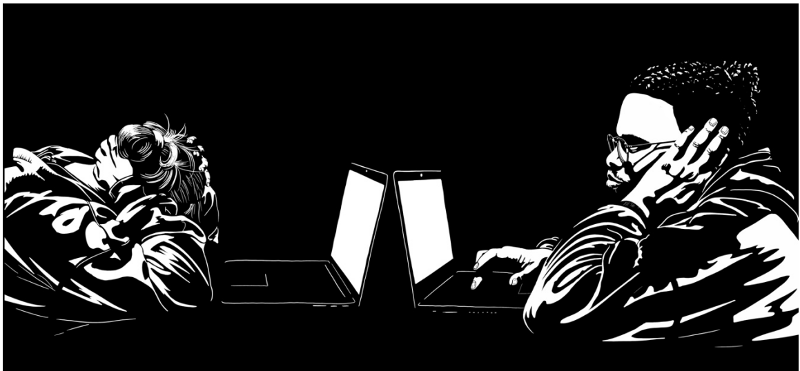
Figure 2: EVPL. 2020925. Digital Drawing (Edition of 10). Series: Our Quarantine . 2021-2022.

My series of digital drawings, Our Quarantine (2020-22), also addresses these intimate spaces through a digital medium that itself reflects upon the shift in virtual spaces. While my drawings normally reside in the physical realm of paper, this series began at the height of the pandemic when I was confined to my home with little to no studio access. As a result, the medium is itself an artifact of the circumstances in which the series began while also ruminating on the means of communicating with one another during that time. These drawings were bound to their own digital landscape, moving from the drawing application on my iPad to the screens of those who view my website and social media accounts. They inhabited the same virtual spaces that we shared with other people. As the world opened up, my drawings also took their first steps into the physical world, finally brought forth physically as canvas prints. However, even as physical, printed documents, they remain contextual artifacts of their creation through their medium.