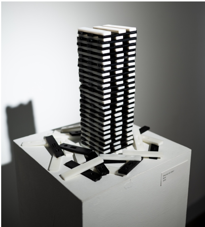
Figure 4: EVPL. What Are the Odds? . Resin. 2022.

Unlike an altered and appropriated found object, a cast object does not occupy that same history of production and use. However, cast objects function as representations of the original and can be replicated numerous times, generating a multiplicity of the original object, referencing but not quite embodying its personal memory as an object. In the context of COVID, this means that specific objects can become safer to touch without that history of use with while also not depleting resources by appropriating needed supplies into an artwork. For instance, What Are the Odds (2022) consists of many resin-cast COVID tests stacked into a Jenga tower formation. To purchase and waste this many tests would be unethical, and sourcing used tests is a bit of a biohazard. By creating castings of my own used tests, I have thus depleting no shared resources and, in doing so, have reiterated what it means to draw line in the sand between what spaces and objects can be shared with myself and by whom.