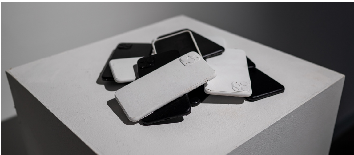
Figure 5: EVPL. Confirmation Bias . Plaster, Glass, & Found Object. 2022.

Another cast work, Confirmation Bias (2022) is composed of black and white plaster- and glass-cast iPhones with the glass phone being encased in a found object, a white silicone iPhone case. While the silicone phone case itself is reminiscent of the casting process, it also brings forth a sense of believability that is amplified by the black glass aesthetic of a dormant phone screen. As a result, the objects are located at different distances away from reality. The plaster phones are easy to identify as “fake,” existing further from collective understanding of reality, whereas the glass phone in the case is much more reality-adjacent and may appear “real” from some angles. Sifting through the imitations seems to imply a relationship between the objects like that of a literary foil: the plaster phones heighten the realism of the glass phone through their obvious fakery. However, in drawing these comparisons, viewers may incorrectly assume a utility or history of the glass phone as a found object when it is merely cast. As reflected in the title, Confirmation Bias , calls viewers to look closer, pay attention to the details, and confront their expectations before drawing conclusions of utility or authenticity.